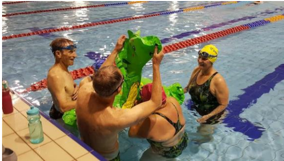
End of Winter Season Fun & Games