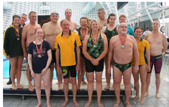
Short Course State Cup Kingfishers Team